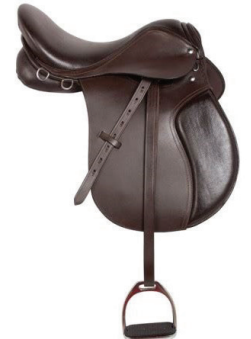
Western & English Saddles, Harness and Tack

Members of: Carriage Association of America, American Driving Society, USEF Concord Coach Society, National & PA Auctioneers Associations