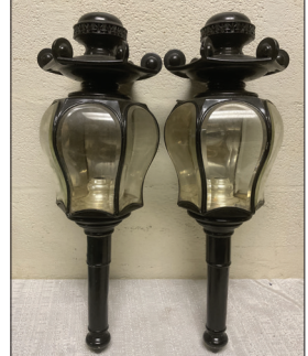
1 Pair of a Large Collection of Lamps