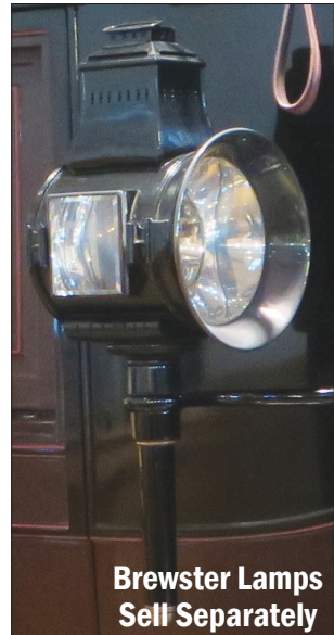
Brewster Lamps Sell Separately