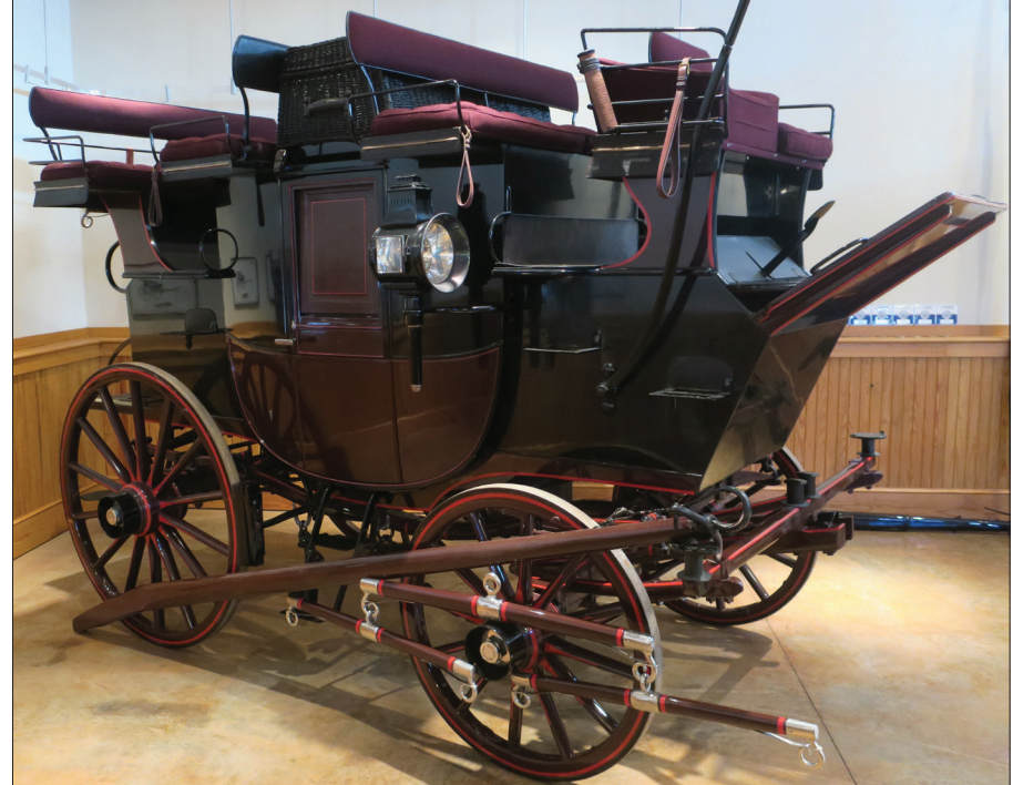
Restored Brewster & Co. Park Drag Serial #23183 Maroon & black body, red striping, wicker umbrella basket, wicker imperial basket, pole, full set of leader bars, ladder, brake shoe & chain, hand & foot brake. Very unusual & rare odometer original on rear axle.

Early Consignments for our Spring 2023 Auction!