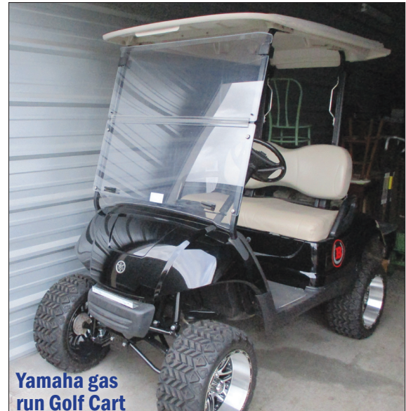
Yamaha gas run Golf Cart