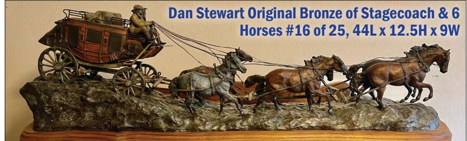
Dan Stewart Original Bronze of Stagecoach & 6 Horses #16 of 25, 44L x 12.5H x 9W