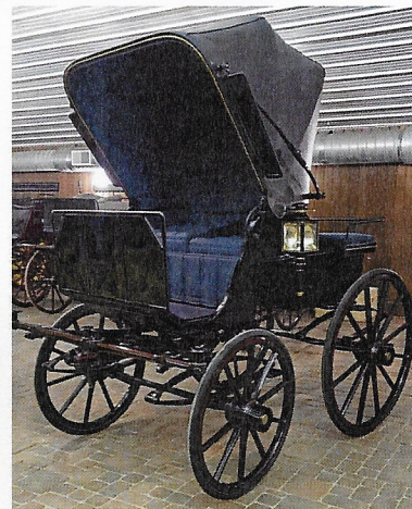
Restored Demi-Mail Phaeton with Brewster Lamps

For Buyers Premium Information, Large Photo Gallery, Terms & Conditions or more information, call 717.354.6671 (note: we have limited office hours), fax: 717.354.8248