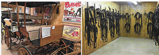
Natural Wood Brewster & Company Station Wagon (Prairie Schooner)