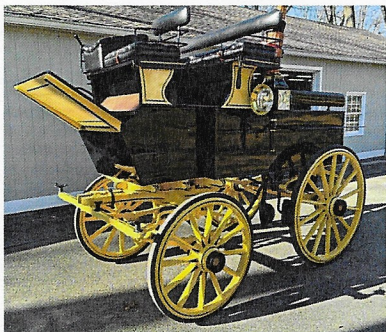
Restored Kimball Body Break

Absentee and Phone Bids Accepted to Qualified Buyers