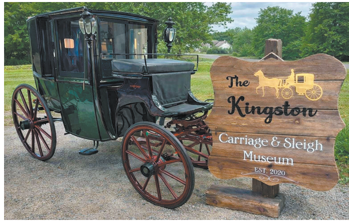
Restored Brewster & Co. Bachelor Brougham #25311

Call now to be placed on our emailing list for this event!