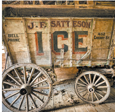
Original Two Horse Ice Wagon (Barn Find in Milton PA where it was originally used)